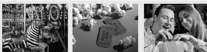
AMUSEMENT PARK TICKET